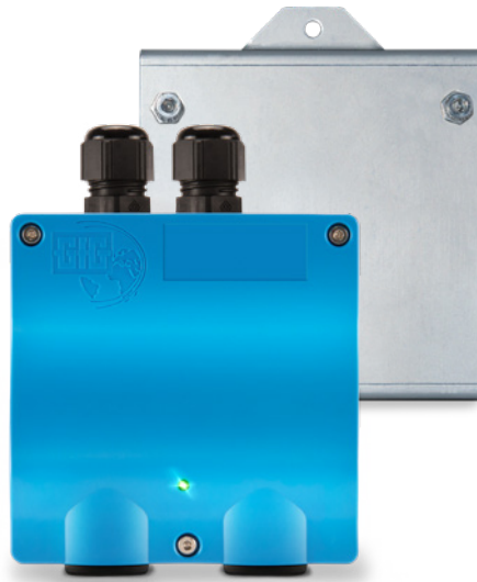
EC22 DS with suitable mounting plate

The EC22 DS dual sensor transmitter is designed to provide reliable and cost effective monitoring of these gases. Depending on the expected pollution of the ambient air, it is available in the sensor combinations CO/NO and CO/NO 2 .