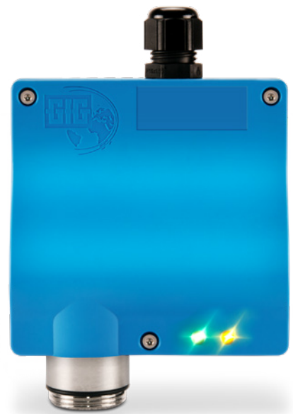
ZD22 D transmitter with one cable entry for analog connection

In combination with GfG's powerful controllers, both variants are the right choice for long-term oxygen monitoring.