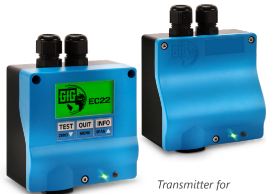
Transmitter for electrochemical sensors, EC22

Feel free to contact GfG anytime if you have question on how to protect your facility or plant in the best way from the hazards of hydrogen.