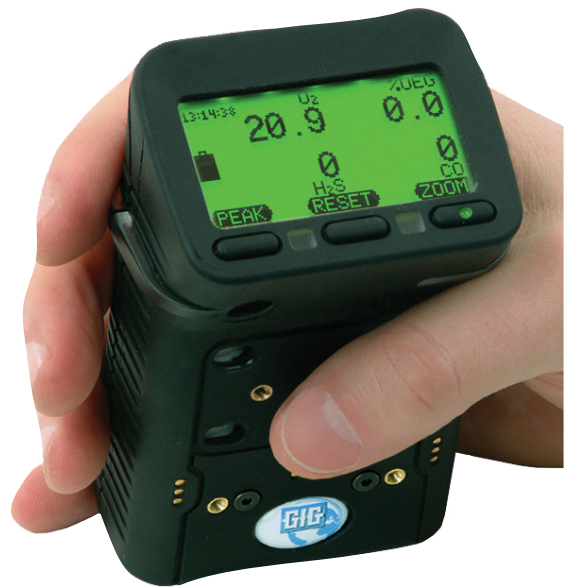
Figure 1: Always allow all of the sensors installed in your instrument to stabilize completely in fresh air BEFORE making a fresh air zero adjustment.

In some designs the dead-band can be quite substantial. For instance, some brands of instruments equipped with miniaturized pellistor type LEL sensors have a dead-band that stretches all the way from -3% to +3% LEL. In other words, in the presence of a rising concentration of gas, the first reading displayed is 4% LEL. At 3% LEL the instrument reading is still "locked" on zero. Similarly, until the output signal reaches a value of -4% LEL, the display shows a reading of zero.