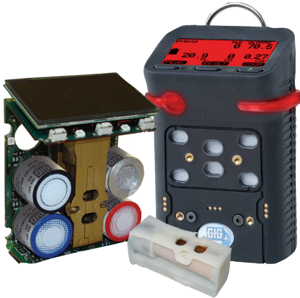
Figure 2: Changes in humidity as well as exposure to certain contaminants can affect the output of gas detecting sensors in fresh air.

Sometimes the manufacturer may simply make the readings a little more "sticky" close to zero, to proportionally reduce fluctuation as the signal gets closer and closer to zero. Whether or not to include a dead-band is a manufacturer decision based on the instrument design and the stability and resolution of the sensor.